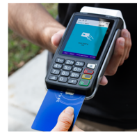
Mobile Card Reader