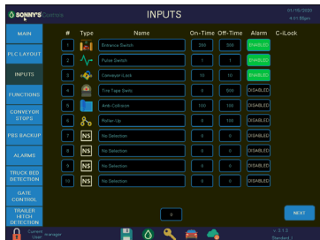
Input descriptions inside PLC

Sonny's Tunnel Controller utilizes top-of-the-line hardware from leading PLC and industrial automation manufacturers to ensure optimal reliability, accuracy, and uptime for harsh environment operation. Featuring a 32" x 74" compact footprint houses a 12" display to toggle relays and monitor your tunnel.