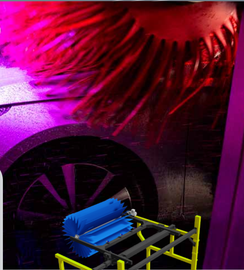
Top Brush™ Base Frame with Optional Powder Coating