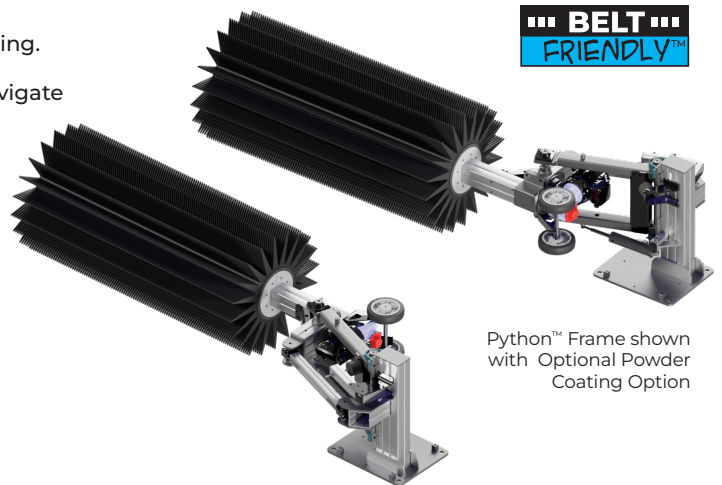
Python™ Frame shown with Optional Powder Coating Option