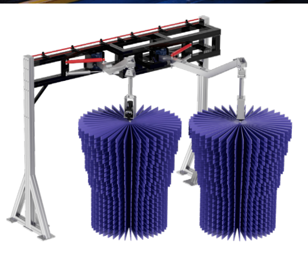
DoubleJog Entrance Wrap-Around Shown with Optional Powder Coating