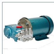
Industrial duty, long-lasting, dependable pumps