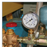
Available pulsation dampener and regulator unloader