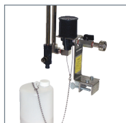
530 Hydrominder (9GPM) to fill tank