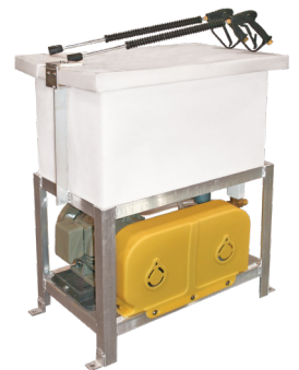
Belt Driven Pump