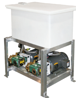
Direct Driven Pump