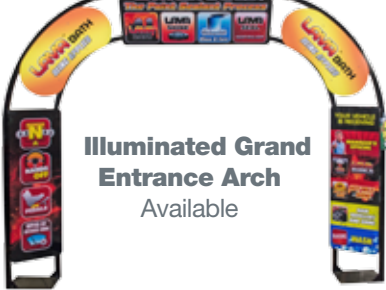
Illuminated Grand Entrance Arch Available