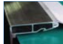
Extruded PVC Side Seals