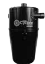
Cyclone Trash Collector

*Customize your perfect vacuum drop. Whether you want both a crevice and express claw tool on a dual drop or prefer a different inlet option, simply specify when ordering.