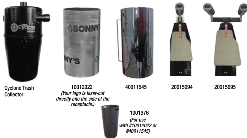
Cyclone Trash Collector