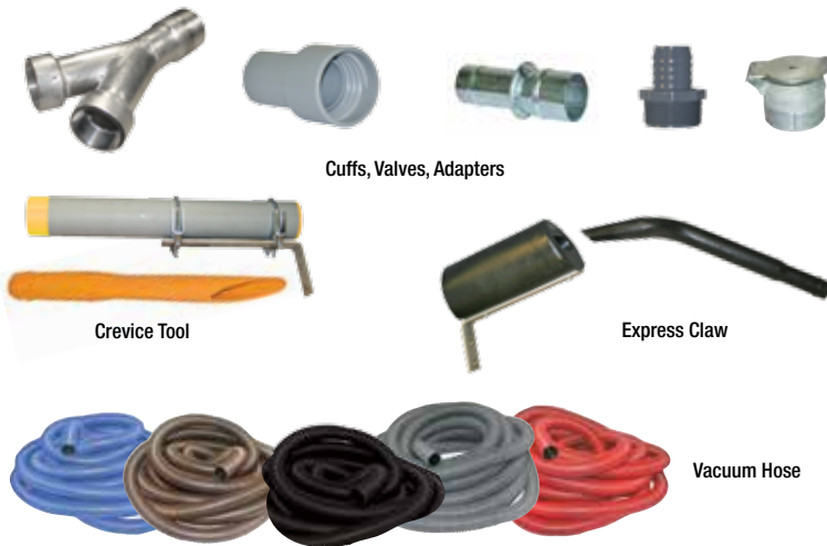
Cuffs, Valves, Adapters