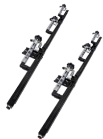
Ceramic X 3 Step 1 & 2 Applicator Foaminator MAXX Stream