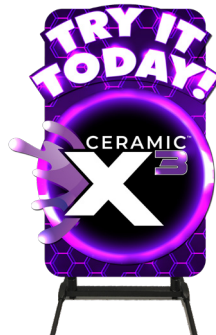
3D Die-Cut Windmaster and Frame (2) Ceramic X 3 Signs