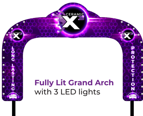
Fully Lit Grand Arch with 3 LED lights