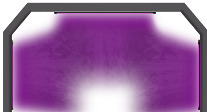
Immersion LEDs 3 GPM Rain Bar