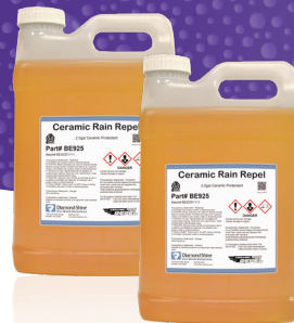
Ceramic Rain Repel Chemical (2) 2.5 gallons

*With purchase of complete sign / equipment package. Call for details.