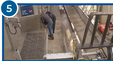
Installing Take Up Frame