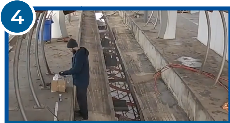
Installing Drive Frame