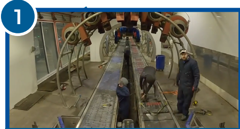
Removing Existing Belting