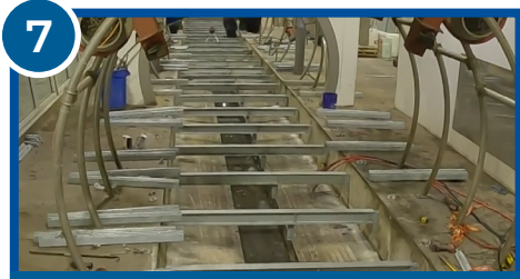
Installing Galvanized Carryway Tubes