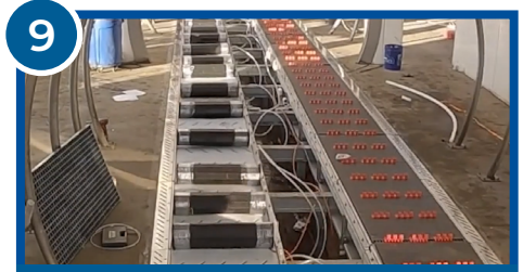
Installing New Belting