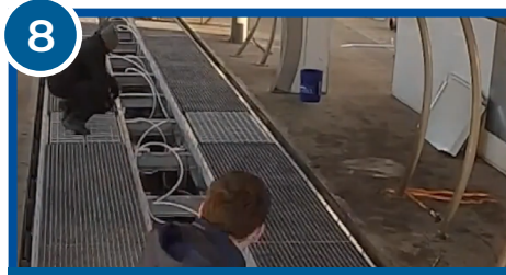
Installing Grating & Flowrinse System