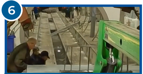
Installing Galvanized I-Beams