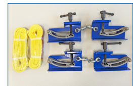
FireClamp kit to simplify maintenance