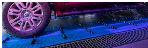
Colormatch lets you match the color of your conveyor to support your brand