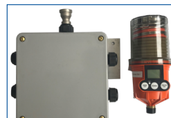
FlowLube Automatic Bearing Lubrication