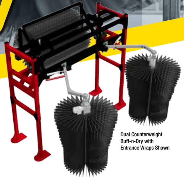
Dual Counterweight Buff-n-Dry with Entrance Wraps Shown