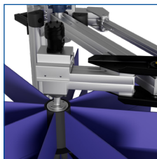
4-bar linkage allows brush to fold in – saving two feet of tunnel length over previous design