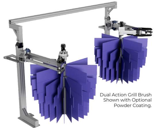
Dual Action Grill Brush Shown with Optional Powder Coating.